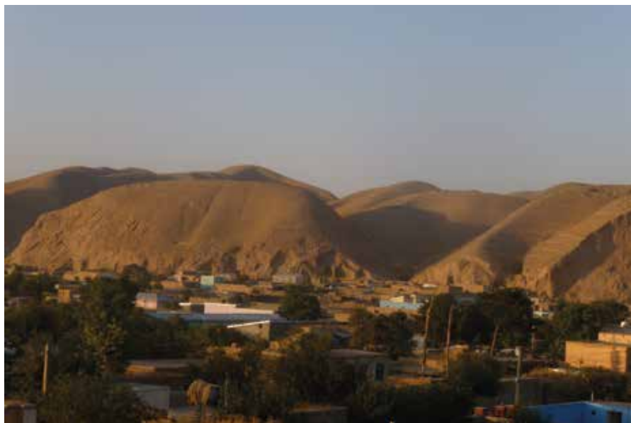
Maymana city, Faryab, Afghanistan. Faryab is one of the most insecure provinces in the north of Afghanistan, with frequent Taliban attacks across the province. Oxfam supported a peacebuilding project with partners from 2009 to 2014, building capacity of local peace Shuras.

Any assumption that civil society is inherently good for peace and democracy is challenged in contexts where dominant CSOs threaten both. 8 For example, the Taliban in Afghanistan began as a civil society movement that developed into a ‘politically repressive, undemocratic and violent regime’. 9 However, in a variety of conflict settings,