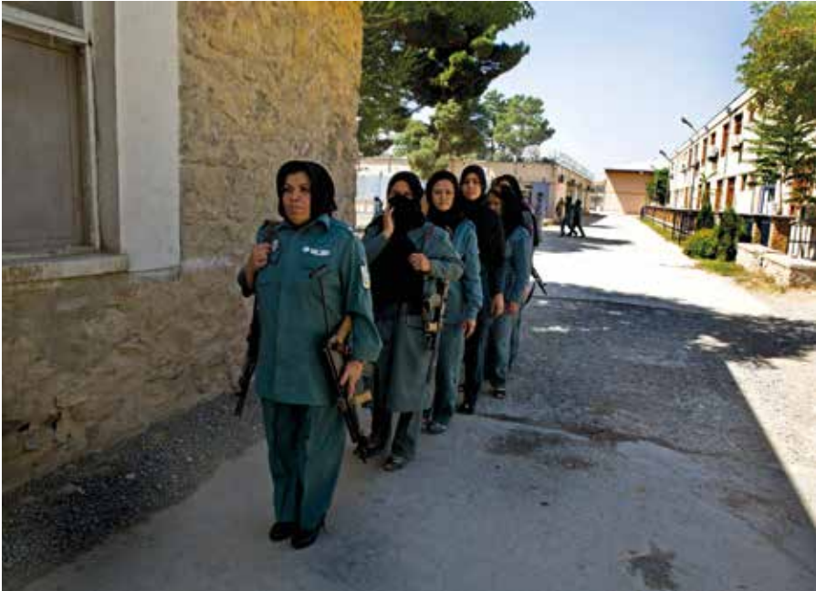
In Kabul, Afghanistan, training for women police recruits takes six months; they learn weapons, general policing and the rule of law, gender and human rights awareness.

Alongside tensions among women's organizations, progress on women's rights and empowerment is curbed by the way in which these issues are all too often expected to be addressed by women's organizations alone. The DRC case study notes that by funding women's organizations alone to address women's empowerment, donors restrict approaches that tackle the wider gender dynamics that underlie gender inequalities. 41 This unintentionally reinforces the way that women's organizations are already marginalized within broader civil society networks, alliances and consortia, where they are sometimes not 'in a position to influence other member organizations or the agenda of the network as a whole' and are therefore unable to secure the backing of wider civil society; 'the work they do is seen as separate', rather than an integral part of mainstream efforts to empower vulnerable communities and groups. 42