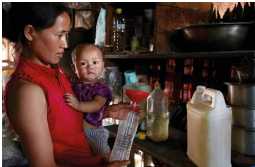
Nhkum received a livelihoods cash grant through Oxfam’s Durable Peace Programme in conflict-affected Kachin state. She is now earning a steady income to support her basic needs. Peace remains critical for longer term prospects.

Interviewees noted that terms like ‘capacity building’ produce a power differential that serves to justify and sustain the dominance of international actors in decision making. 56 While they did not wish to seem ungrateful for the support they have received from international partners, CSO respondents in DRC expressed frustration about the endless stream of invitations to poorly tailored ‘capacity building’ workshops with little or no follow-up. 57 They called on international actors to reflect on the limitations of this approach, which is driving partnerships that are more transactional than transformative. 58 Support needs to address the context-specific needs of CSOs in violent and politically polarized environments. 59