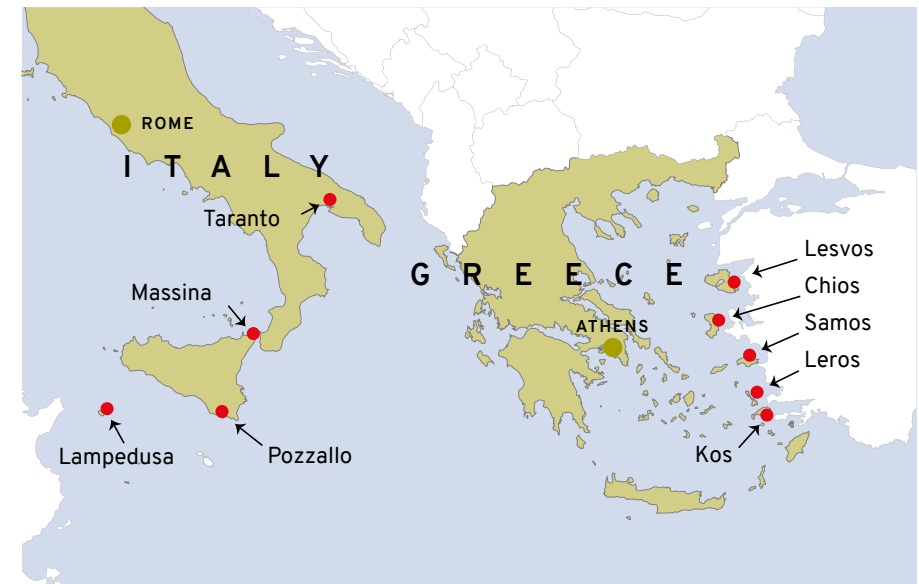
Figure: Migration hotspots - 2020