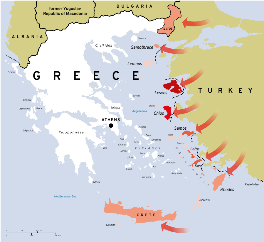
Sea arrivals 2015