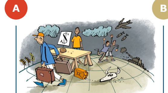
Scenario A: Global Food Crisis (Low Food System Resilience, Conflict Escalation)

Together with eight humanitarian and development organizations, KUNO, NFP & WUR developed the following four scenarios of the impact of the war in Ukraine on food & nutrition security in fragile, low-income countries.