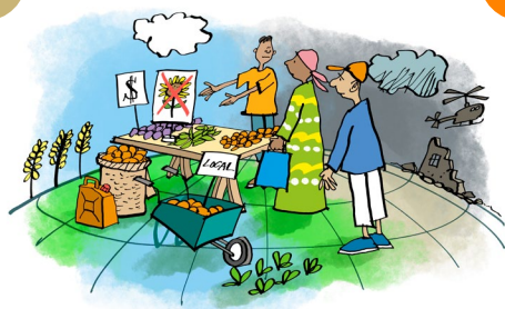
Scenario B: Forced Adaptation (High Food System Resilience, Conflict Escalation)

Even though global markets adjust to decreased supply from Russia and Ukraine, the regional spread and uncertain outcome of the conflict increases the prices of food, fuel and inputs. High food prices, decreased foreign investment and stretched aid budgets decrease the resilience of local food systems. Regional spread of conflict diverts resources from humanitarian aid in prolonged crisis areas. Hunger is used as political weapon in an increasingly polarized world. Growing food insecurity leads to social unrest in importdependent countries. New, deepening conflicts may challenge local governance and lead to more economic migration and refugee flows.