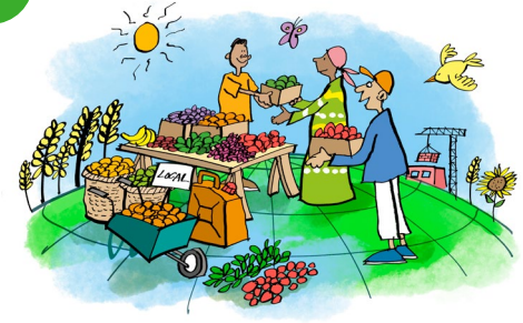
Scenario D: Ready for the future (High Food System Resilience, Conflict Containment)

Grain and vegetable oil prices first stabilize and then continue rising again due to prolonged sanctions and increasing impacts of climate change. Food systems adapt short-term to shortages in grain and vegetable oil from Ukraine, but continue to be highly sensitive to shocks. The global food system continues to face the impact of climate change, food insecurity and economic inequality – the status quo of the food system structure remains intact, including current economic inequalities. After initial spikes in food insecurity in many fragile countries, hunger and undernutrition return to prewar levels but continue the rising trend and increased vulnerability witnessed in the past five years due to climate events and regional conflicts.